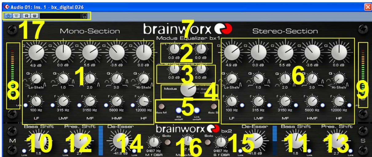
bx1 & bx2 - Screenshot