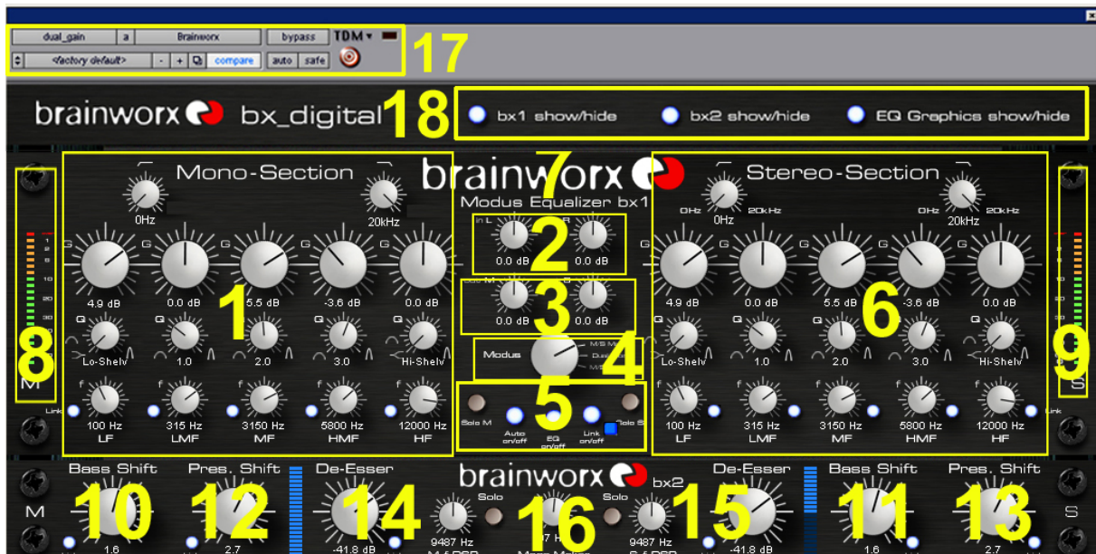
bx1 & bx2 - Screenshot